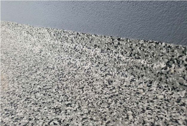
Goondiwindi SHS - Amenties Block Coving and Flake Floor