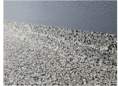
EDGE COVING & FLAKE FLOORS