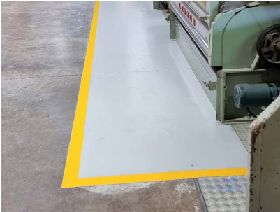
PROTECTIVE COATINGS: SAFETY, CHEMICAL RESISTANT