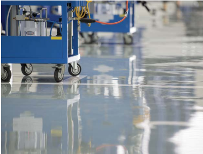
EPOXY SYSTEMS: 2 PACK, SINGLE PACK, FOOD GRADE

INTERNAL | EXTERNAL | INDUSTRIAL | COMMERCIAL