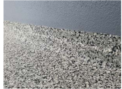
EDGE COVING & FLAKE FLOORS