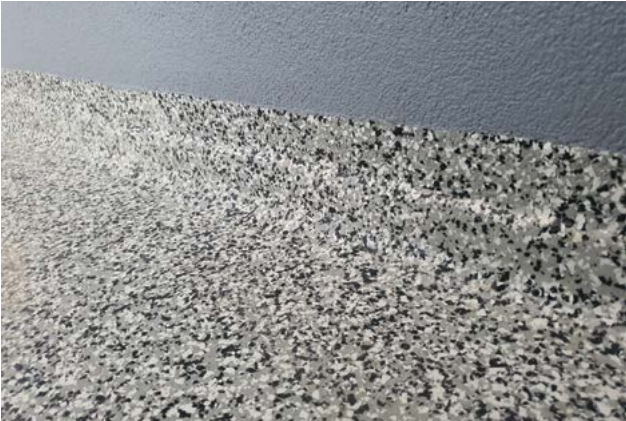
Goondiwindi SHS - Amenties Block Coving and Flake Floor