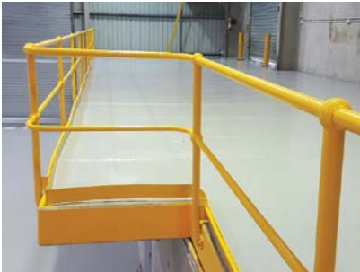
PROTECTIVE COATINGS: SAFETY, CHEMICAL RESISTANT