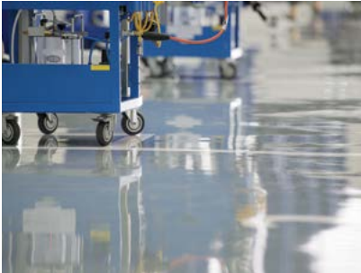
EPOXY SYSTEMS: 2 PACK, SINGLE PACK, FOOD GRADE

INTERNAL | EXTERNAL | INDUSTRIAL | COMMERCIAL