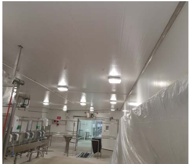
South Burnett Regional Council - Kingaroy - Chemical Bund